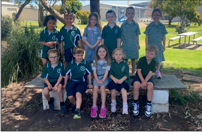
Foundation students - February 2024

As the educational journey for thirteen reception students commences, six Year 12 students now embark on their final year with AEAS. A blank canvas awaits the final year students, for each to make their own individual mark and work towards their chosen goals for life following secondary education. We wish all students from Foundation right through to Year 12, a year full of learning, friendship, fun and the creation of many happy memories. Go well!