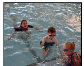
Swimming program action - December 2023